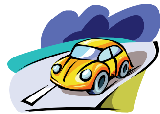
Know the facts before you drive away.